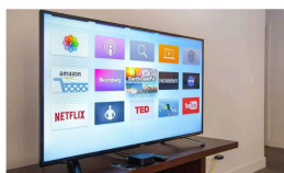
All Utilities Included